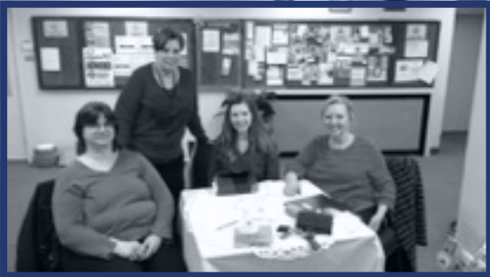
Women’s Ministry (Seamless Bible Study)

The theme for Women’s Ministry this year was ‘Building Our Foundation on the Word.’ Reflecting this, this fall we attended ‘Priscilla Shirer Live’, gathering with other women to pray for one another, worship together, and be taught by God’s Word. This winter, we studied ‘Seamless: Understanding the Bible as One Complete Story.’ We gained a deeper understanding of God’s promises. It was a very rich time of learning and praying for one another. One attendee wrote: ‘My heart was touched, my knowledge deepened and my desire to know Jesus strengthened.’ Praise God for His faithfulness to the women of Calvary.