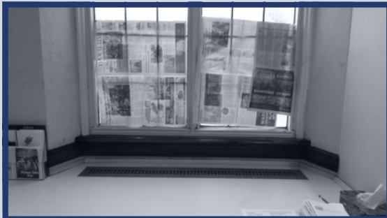
Persecuted Church Sunday (blocked windows)