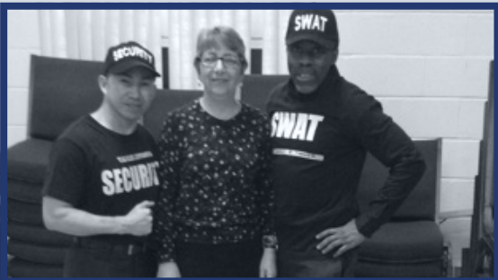
Persecuted Church Sunday (Swat Team)

We are actively exploring exciting partnerships for the future that focus on youth, Indigenous communities and educational opportunities for international pastors. Stay tuned for further announcements.